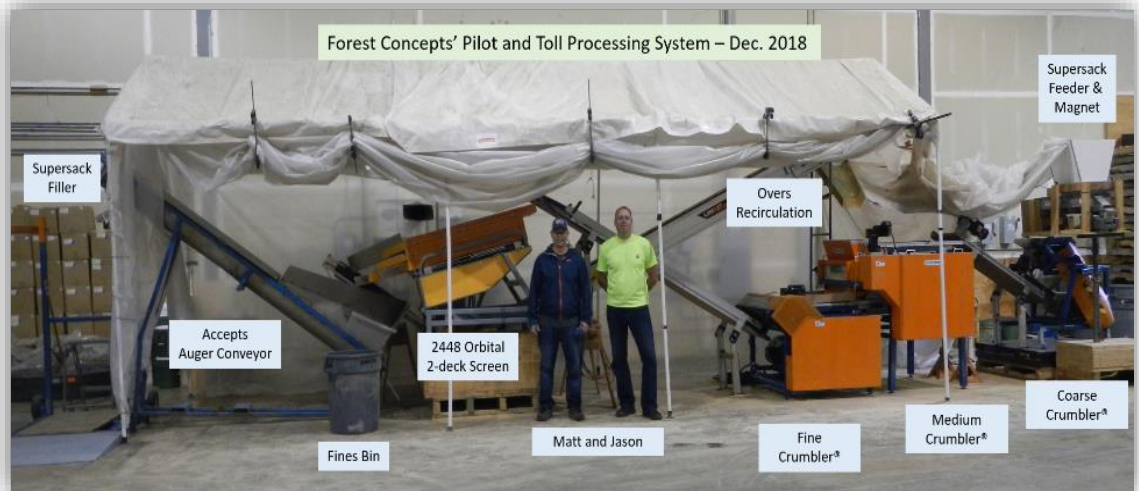
Modular, integrated facility capable of creating fine uniform biomass feedstocks.

Everyone needs quality optimized reactor-ready biomass feedstocks for their conversion process to minimize OPEX while maximizing yields